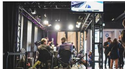
Live Interviews & Streaming