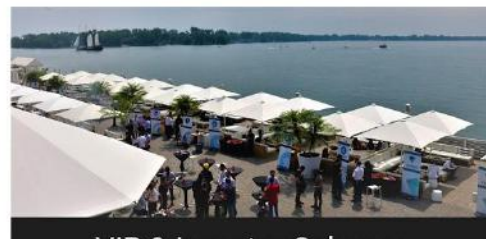
VIP & Investor Cabanas