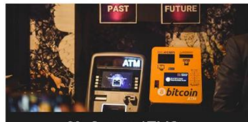
0% Crypto ATMS