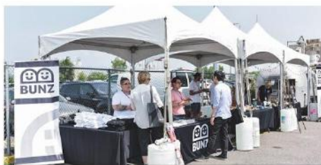
Crypto Marketplace & Food Trucks