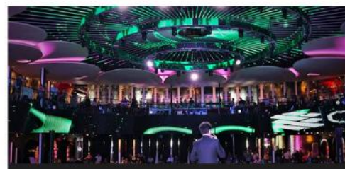
$50 Million Sound & Lighting Stage