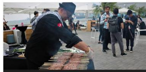
Fresh Food Stations